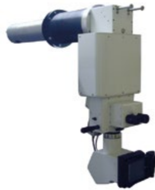
Raman Spectroscopy Microscopes