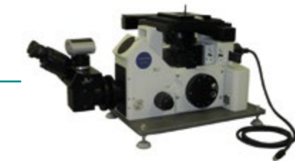
Raman spectroscopy Microscopes